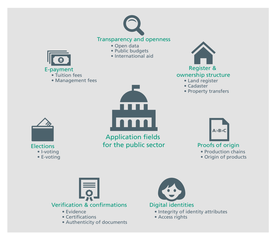
Fig. 3: Application fields of blockchain technology which are frequently discussed on the international level [17]

technology<sup>10</sup> for several years. Since 2015, the country has also been offering a blockchain-based emergency service with its e-residency program. In addition to Estonia, many other countries are working intensively on the technology and developing strategies for using blockchain in administration, including the United Kingdom, Dubai and the United States. In the process, a variety of application scenarios are being discussed.