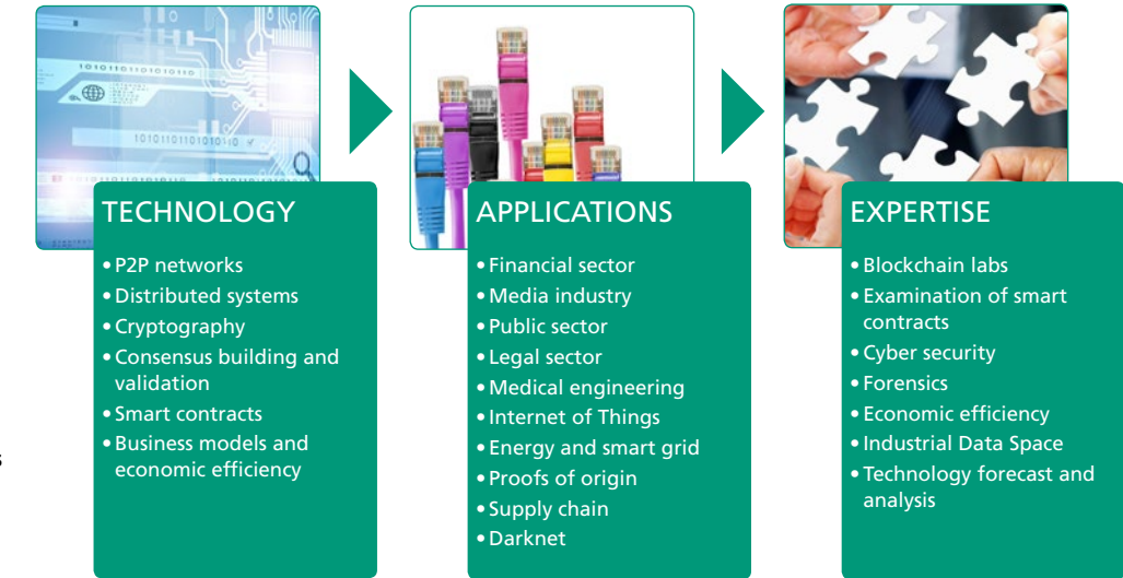
Fig. 1: Technology, applications and competencies from the point of view of the Fraunhofer-Gesellschaft

This position paper analyzes blockchain technology from the scientific and application-oriented perspective of the Fraunhofer-Gesellschaft. It examines relevant technical aspects and related research questions. It shows that technology still has fundamental research and development challenges in all areas. These include, for example, the modularization of individual blockchain concepts as well as their combination and integration for application-specific blockchain solutions.